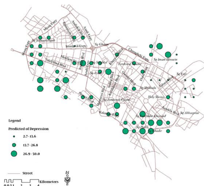
Figure 1. The Prevalence of depression based on longitude and latitude: Mashhad Stroke and Heart Atherosclerotic Disorder study, Iran, 2010

b Mean differences by depression status are tested using two-tailed t-tests for age and chi-square tests are used for others.