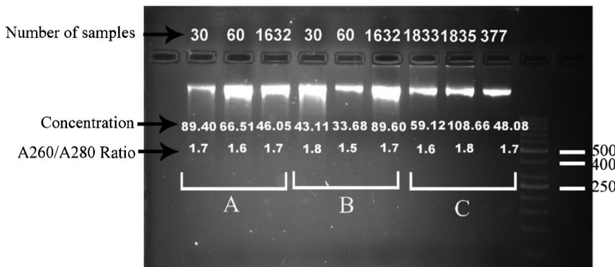
FIGURE 1 Comparison of genomic DNA purified from clotted blood by each extraction method on 2% agarose gel. Stained with DNA Green Viewer ™ . A: modified salting-out method, B: modified QIAamp ® DNA Blood Midi Kit, C: QIAamp ® DNA Blood Midi Kit. Lane 11:50-bp DNA ladder (Fermentas)

Values are expressed median (Q1-Q3). Comparisons were performed by Kruskal-Wallis test.